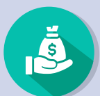
Diagram 3: Preserving the Smooth Functioning of the Financial Intermediation Process to Support Economic Recovery and Post-COVID-19 Economic Restructuring and Reforms