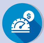
Diagram 2: Regulatory and Supervisory Measures to Facilitate Repayment Assistance Programmes and Support Lending to the Real Economy